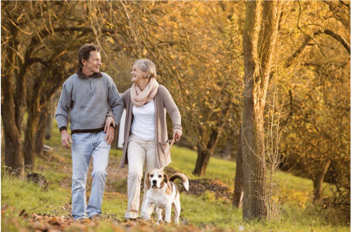
This is a representative image